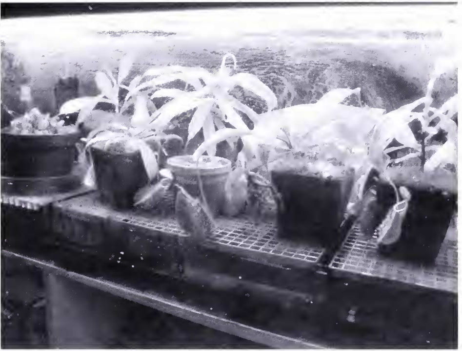
Figure 2: A 160 liter (40 gallon) terrarium containing Nepenthes and Cephalotus .